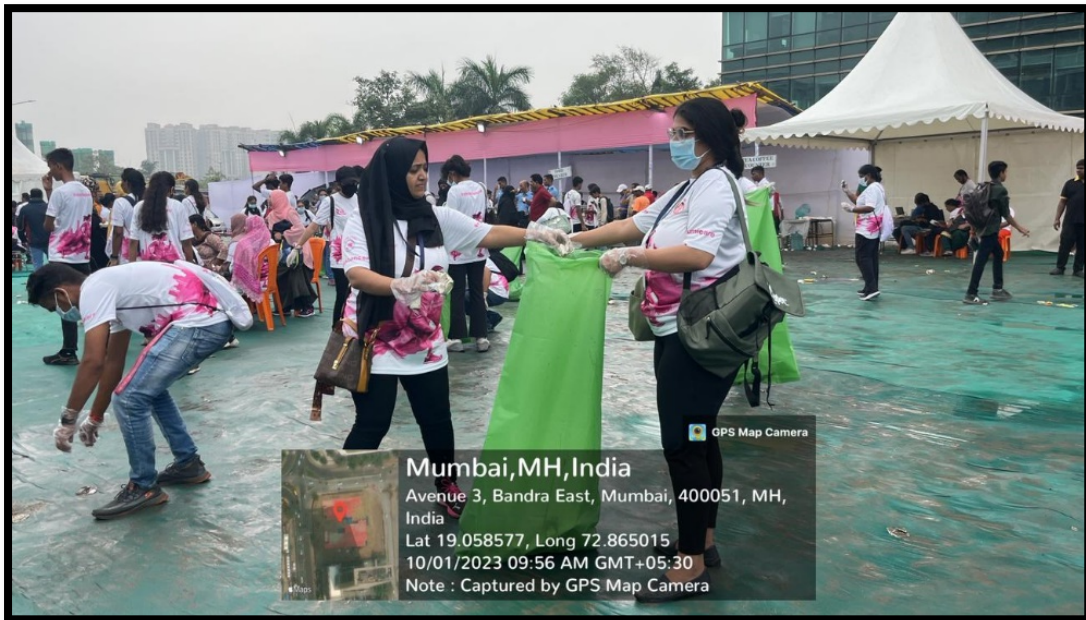
Mumbai, MH, India Avenue 3, Bandra East, Mumbai, 400051, MH, India Lat 19.058577, Long 72.865015 10/01/2023 09:56 AM GMT+05:30 Note : Captured by GPS Map Camera