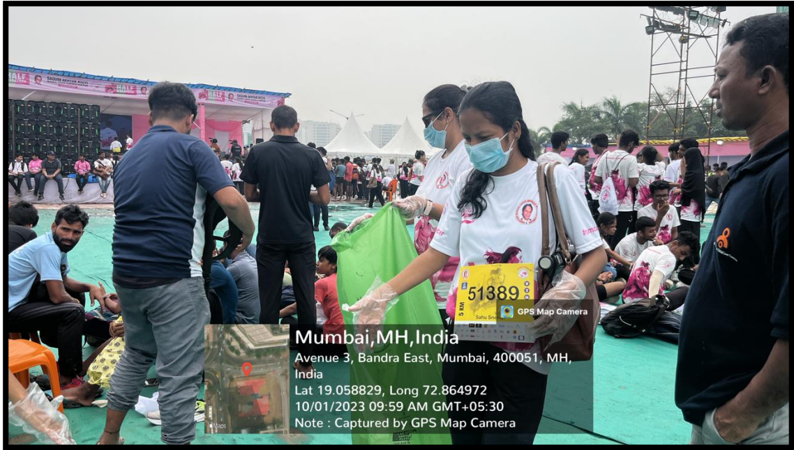
Mumbai, MH, India Avenue 3, Bandra East, Mumbai, 400051, MH, India Lat 19.058829, Long 72.864972 10/01/2023 09:59 AM GMT+05:30 Note : Captured by GPS Map Camera