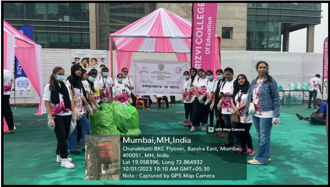
Mumbai, MH, India Chunabhatti BKC Flyover, Bandra East, Mumbai, 400051, MH, India Lat 19.058396, Long 72.864932 10/01/2023 10:10 AM GMT+05:30 Note : Captured by GPS Map Camera