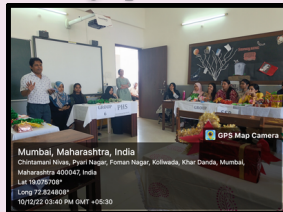
Tableau for school